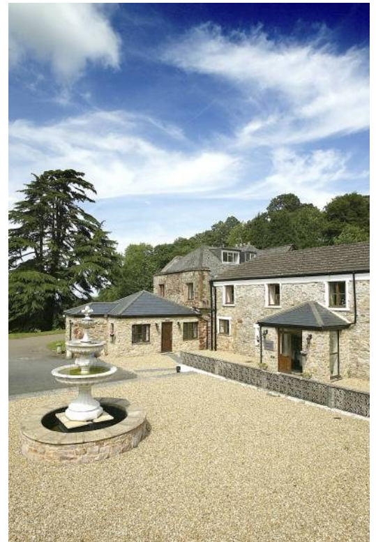
New home of the LOC, Deer Park Business Centre